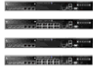
Table 1: Platform Notes (Continued)